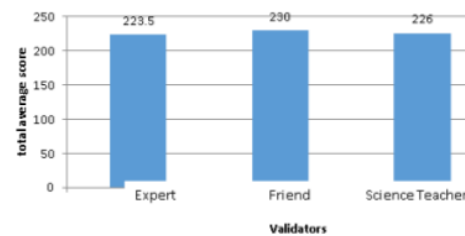
Figure 4. Chart of total average score of learning material validation sheet

tal average score from each validators was changed into qualitative data (interval data) with Likert scale of 4 criteria and the result were: (1) the appropriateness of science domain based learning material which was integrated with developed local potentiation according to expert lecturers was very good with value A, (2) the appropriateness of science domain based learning material which was integrated with developed local potentiation according to friends was very good with value A, (3) the appropriateness of science domain based learning material which was integrated with developed local potentiation according to science teachers was very good with value A.